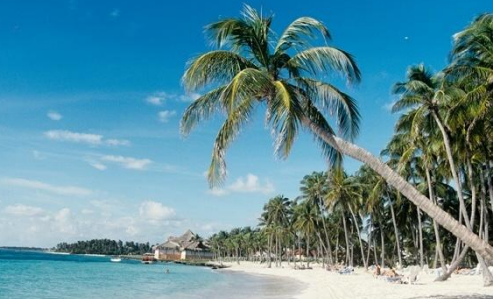
White sandy beach